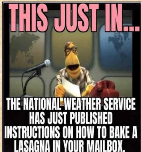
Submitted by... Bonnie