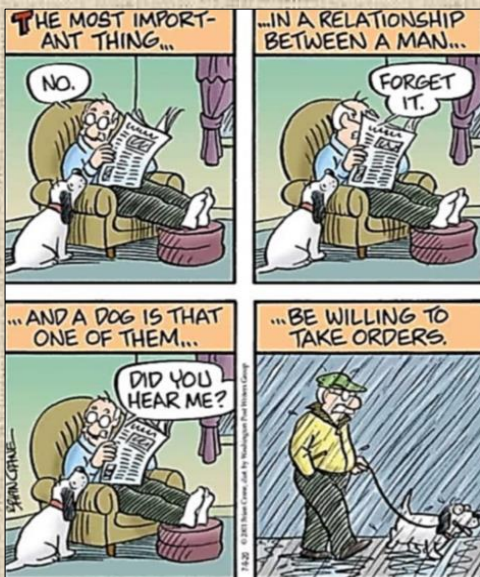
Submitted by... Bonnie

Click here https://copd.net/living/emotional-toll