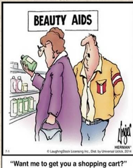
Submitted by ... Al Skelhorne